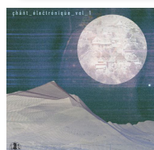
NO 8. CHANT ELECTRONIQUE CHANT ELECTRONIQUE VOL. 1 / RIKI MUZIKA