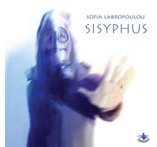
NO 2. SOFIA LABROPOULOU SISYPHUS / ODRADEK RECORDS