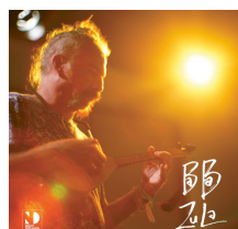
NO 6. BABA ZULA HAYVAN GIBI / NIGHT DREAMER & GULBABA RECORDS