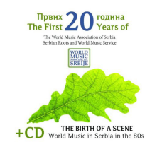
NO 4. V. A. THE BIRTH OF A SCENE: WORLD MUSIC IN SERBIA IN THE 80s / WMAS RECORDS