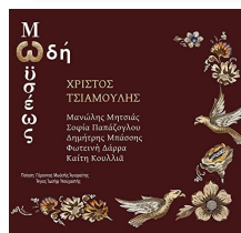
NO 9. CHRISTOS TSIAMOULIS ODI MOISEOS / SAINT MAXIM THE GREEK INSTITUTE