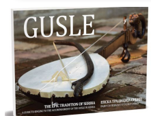
NO 5. V. A. GUSLE: THE EPIC TRADITION OF SERBIA / WMAS RECORDS